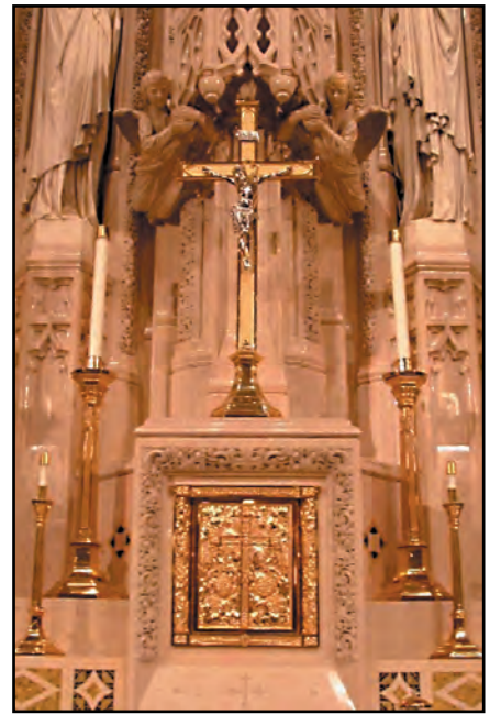
Blessed Sacrament Church, Springfield

11. The same is true with attracting people to the Church. We do not start by listing rules. The beauty of our church edifices, magnificent works of religious art and the graceful celebration of the liturgy, accompanied by harmonious music, inspiring homilies and the active participation of the faithful, are the foundational elements that attract people to the liturgy. Attention to the liturgical norms only comes after one has an appreciation for the art of the celebration.