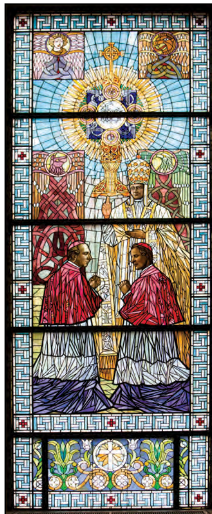
Cathedral Church of the Immaculate Conception Window: 1926 Eucharistic Congress

24. Some may object to this directive and point, by means of example, to the Basilica of Saint Peter in Rome to suggest that tabernacles should not be located in the sanctuary. Saint Peter’s, of course, is different from the average church or chapel in many respects. Chief among these differences is the number of tourists who visit the Basilica each day, with no intention of praying to the Lord therein. These tourists enter this remarkable edifice built to the honor of the Prince of the Apostles simply to look around, to see the architectural beauty and perhaps to see some aspect of Catholic worship, but not to pray. The Eucharist is reserved in a special chapel into which tour groups are not permitted so that the reverence and adoration due the Eucharist can be properly accorded him by pilgrims seeking to speak with him.