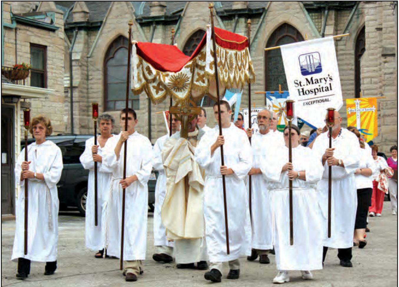
Ss. James and Patrick Parish, Decatur

33. As a young boy, it was the custom in my home parish of Saint Casimir to have an Easter sunrise Mass at 5:30 a.m. which included a solemn procession of the Blessed Sacrament around the church. At the parish where I served as Pastor on the north-west side of Chicago, Saint Constance Parish, this custom was observed with a standing room only crowd of over a thousand people overflowing the church at daybreak on Easter morning. On the Solemnity of the Body and Blood of Christ ( Corpus Christi ), our procession with the Blessed Sacrament carried by the priest in the monstrance went around the block of our parish grounds, with stops at four altars set up by the faithful for Benediction.