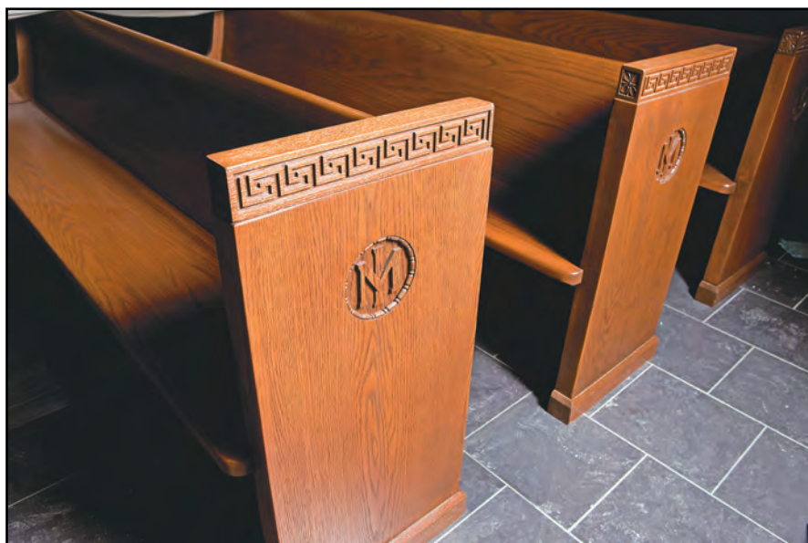
Cathedral Church of the Immaculate Conception

32. In order to keep these words in our hearts and put them into practice, it is helpful to be purposeful and deliberate in the moment of genuflection. One may avoid a hasty and irreverent slide through an attempted genuflection by consciously touching the right knee to the ground and humbly pausing momentarily before rising again. In doing so, we not only pay proper respect to the Lord, but we also remind ourselves in whose presence we are.