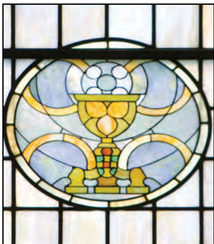
Cathedral Church of the Immaculate Conception